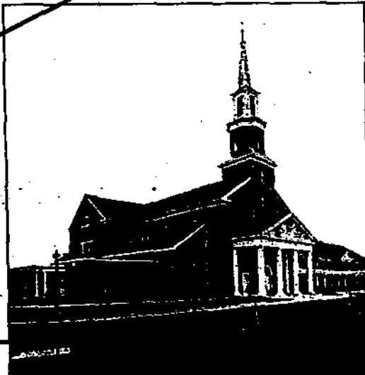
This is the exterior of the new Frederick Seventh-day Adventist Church at 6437 Jefferson Pike.

The Frederick Adventist School and gymnasium were spared and served the congregation as a location for both services and classes while the new